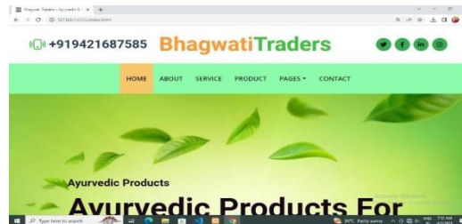
Screenshot 4.1 Home Page

This are some screen shots of our project. Home page and login form and database and product list is also showing. When user fill up the login form then their information is stored in database.