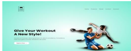
Screenshot 4.1 Home Page

This are some screenshots of our project. Home page and registration form and database of registration form and menu is also showing day wise. When user fill up the registration form then their information is stored in database.