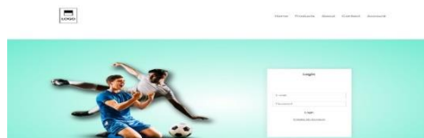
Screenshot 4.2 User Registration