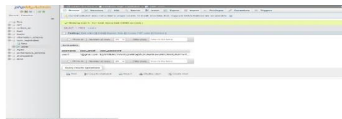
Screenshot 4.3 User Registration Database