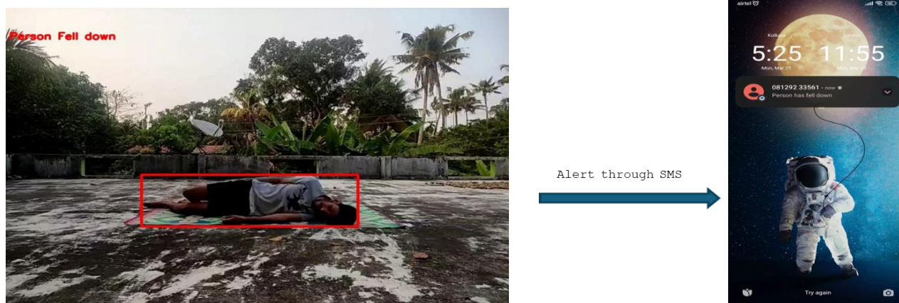
Fig 3 : Working of proposed system