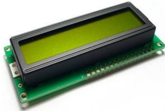
Fig 2 LCD Display

A liquid crystal display (LCD) is a thin, flat panel used for electronically displaying information such as text, images, and moving pictures. Its uses include monitors for computers, televisions, instrument panels, and other devices ranging from aircraft cockpit displays, to every-day consumer devices such as video players, gaming devices, clocks, watches, calculators, and telephones. Among its major features are its lightweight construction, its portability, and its ability to be produced in much larger screen sizes than are practical for the construction of cathode ray tube (crt) display technology.