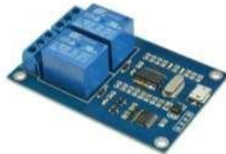
Fig 3 Relay Board

Relay is a switch that open and close circuits electromechanically. Relay control one electrical circuit by opening and closing contacts in another circuit. When the relay circuit detects the undesirable condition with an assigned area and gives the command to the circuit breaker to disconnect the affected area. Thus protects the system form damage.